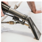
Steam Extraction Machines